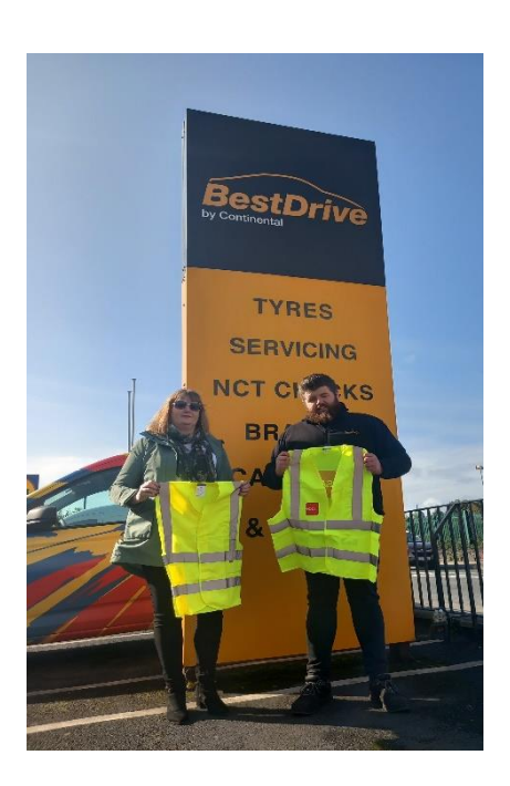
Photo: BestDrive distributed High Visibility Vests to their customers during the winter months

As the evenings get shorter and the weather gets more changeable, it is of the utmost importance that vehicles are in proper working order. For the month of October, BestDrive offered road-users the opportunity to avail of BestDrive's FREE 5 Point Safety Check to ensure that the vehicle's Tyres, Brakes, Shocks, Lights/ Levels and Wipers are working correctly. It will give peace of mind knowing your car is fit for driving during the winter.